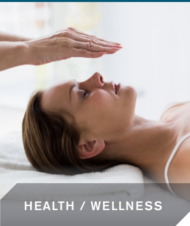
HEALTH / WELLNESS